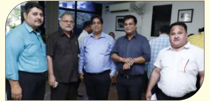
Glimpses of the day when this dream became a reality