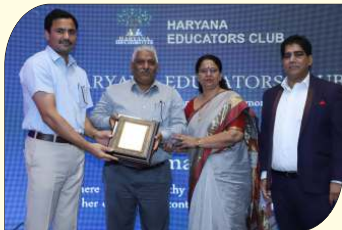
Mr. Hukam Chand Narwat Paramhans Senior Sec. School