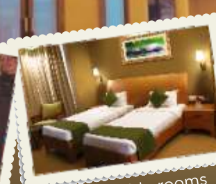
Comfortable rooms and Vedic library