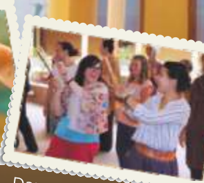
Dance & Music therapy