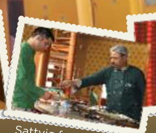
Sattvic food & Indian cooking classes