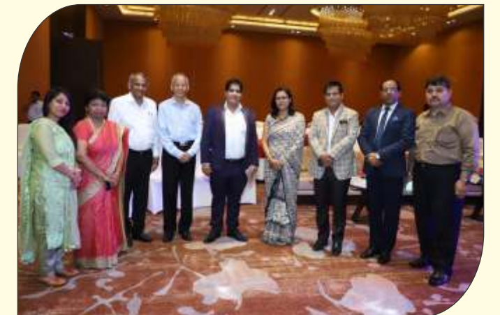
A momentous day that brought eminent and revered educators together