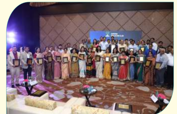
Motivated Team of Educators , United for a 'cause'