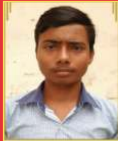
LALIT - 98% (10 th ) 8 th in Haryana Board 1 st in District