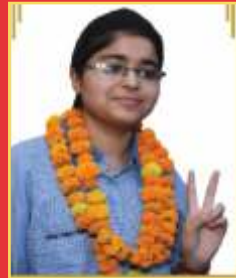
JAYA - 97% (10+2 Comm.) 1 st in District